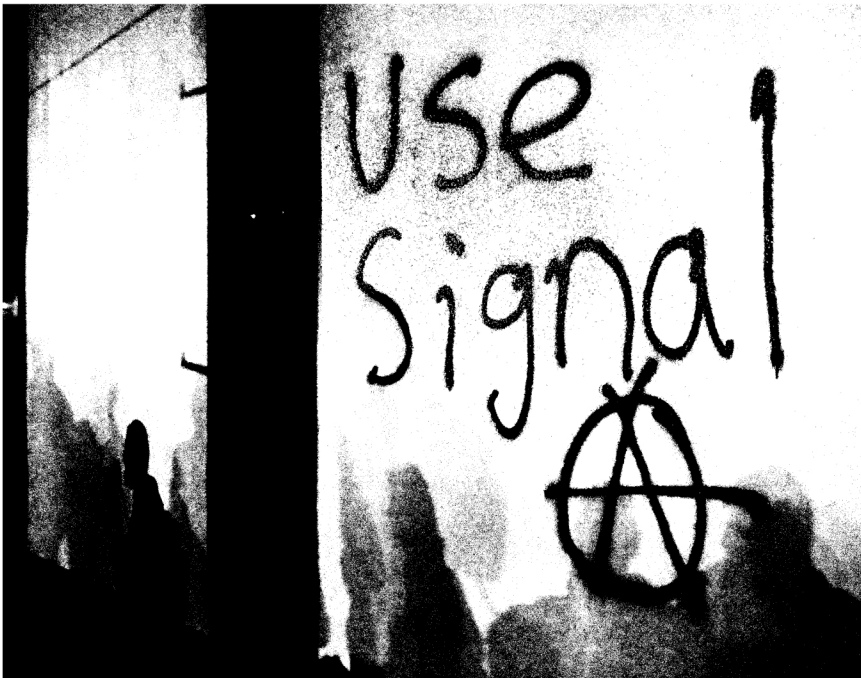
Riots at UC Berkeley, 2017

Primarily for security reasons, Signal has become the standard communication medium in anarchist circles over the last 4 years, eclipsing everything else. But just as "the medium is the message," Signal is having profound effects on how anarchists relate and organize together that are too often overlooked.