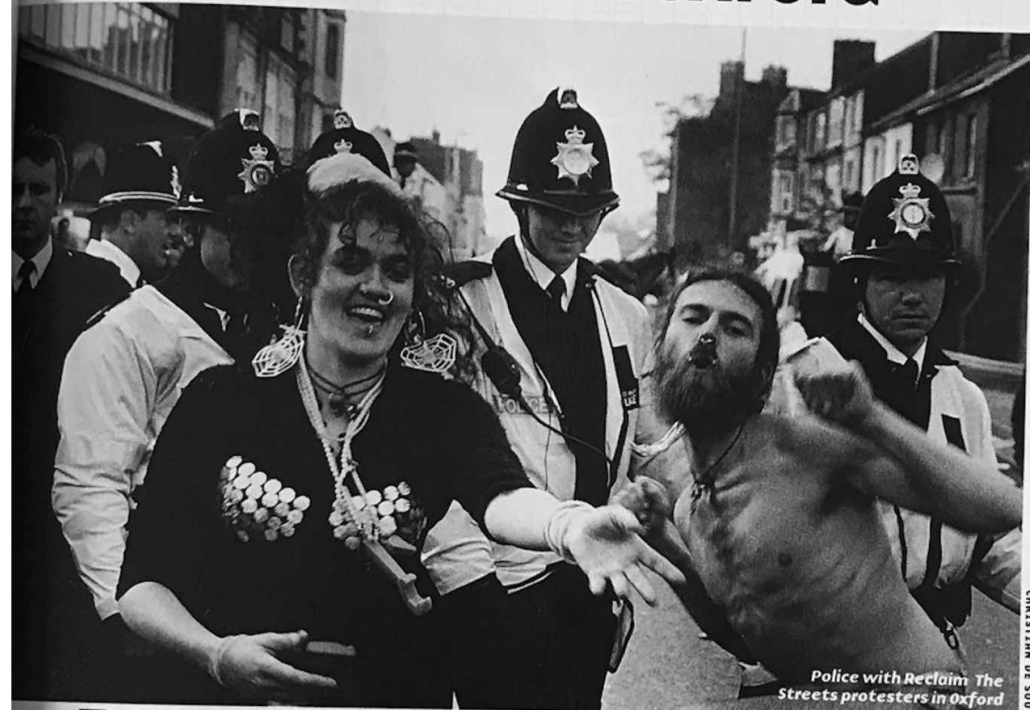
Police with Reclaim The Streets protesters in Oxford

P OLICE have failed to stop an Oxford Reclaim The Streets party despite ugly clashes. A simultaneous demo, held in Australia, passed off peacefully.