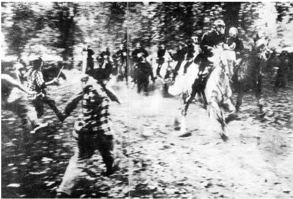
October 1994: Anti-Criminal Justice Act demonstrators fight police on horseback in Hyde Park, London.

alliances built around opposing it did not disappear or slow down.