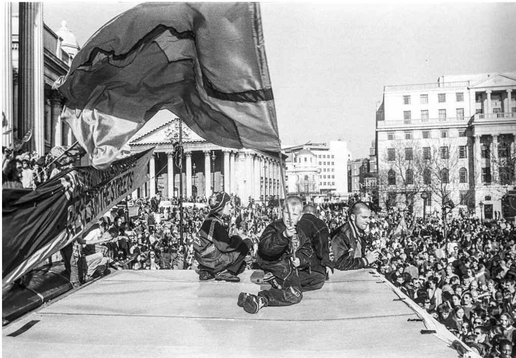
Never mind the ballots—reclaim the streets

To “reclaim the streets” is to act in defense of and for common ground. To tear down the fence of enclosure that profit-making demands. And the street party—far from being just anti-car—is an explosion of our suppressed potential, a celebration of our diversity and a chorus of voices in solidarity. A festival of resistance!