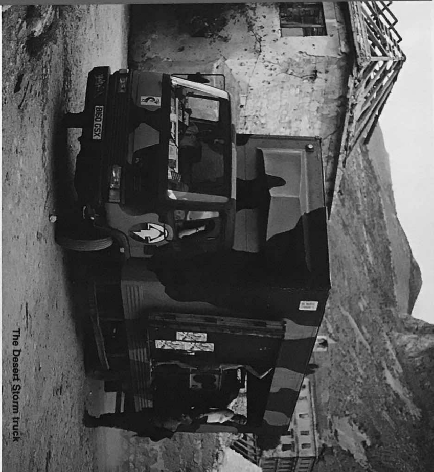
The Desert Storm truck

The Desert Storm truck was seized the following day, and the sound system is currently planning a series of benefit parties to replace its loss. A Desert Storm spokesman commented, “We'll be back.”